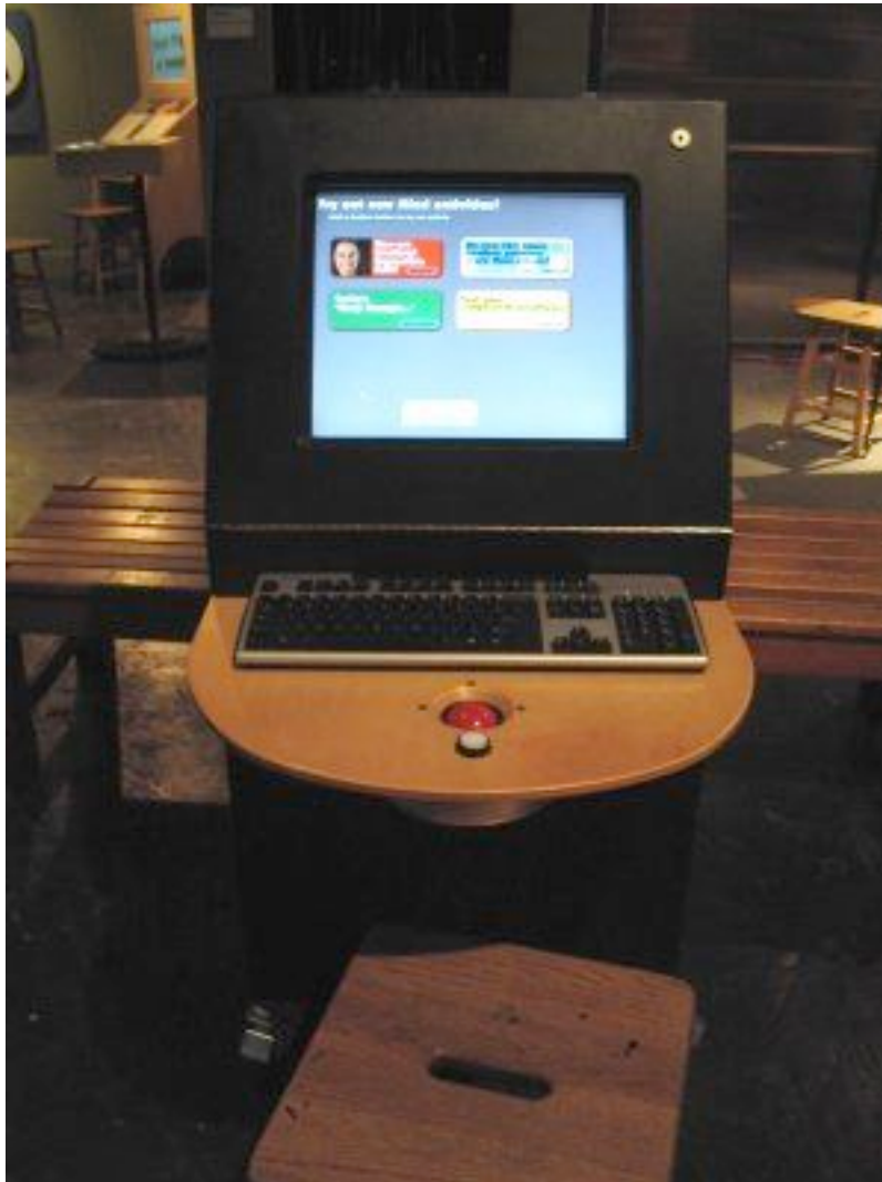
Fig. 3: The MOIK (Mind On-line Interactive Kiosk)

Meanwhile, a simple tracking script in PHP and MYSQL that logs every screen jump runs on each Flash interactive and Web page. This click-stream data gives us an indication of which interactives are being used and which pages of each interactive are visited.