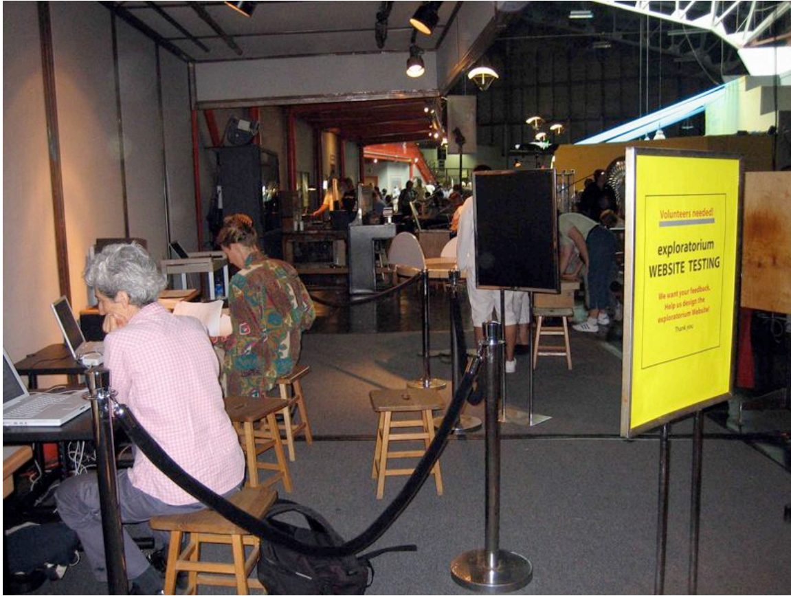
Fig 2: A transient evaluation corral set up in an exhibit space at the Exploratorium that was used to recruit visitor and test design ideas and Web prototypes.

Finally, visitors were given an opportunity to share any other comments they had about their experience reading the articles and reflecting on the evidence presented. At the conclusion of the interview, the evaluator thanked the visitors for participating and gave them a small gift from the Exploratorium Store. The results yielded a core set of questions (Table 1) that were then further refined as questions to be used in the next iteration of the Web site design.