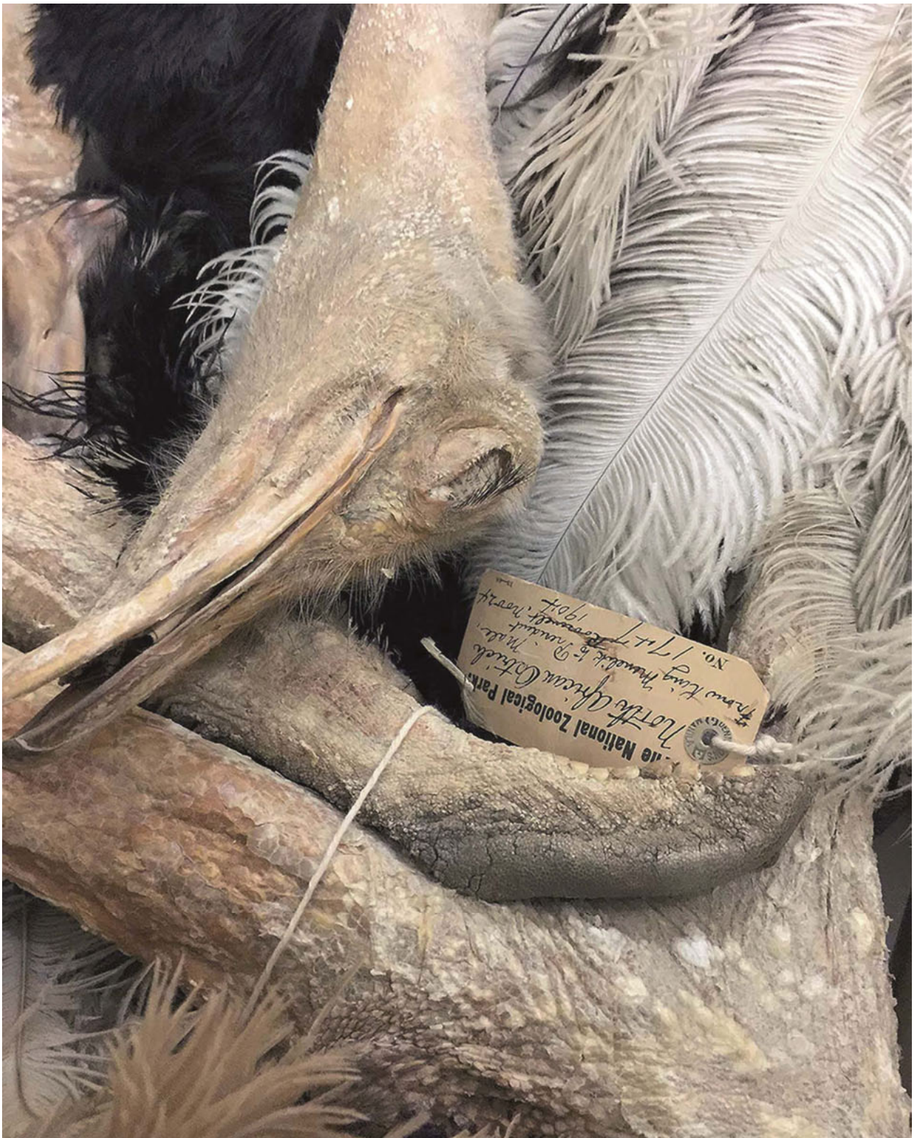
Figure 1. An ostrich collected by Theodore Roosevelt during a 1909 African safari. Note the newspaper still visible through the eye. (Smithsonian National Museum of Natural History, Division of Birds, March 2015).